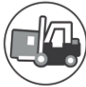
Inventory & Logistics